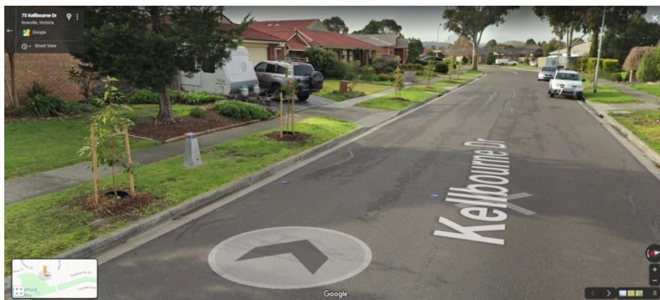
Clue 5 ( Hint : Fire Hydrants are often indicated by a blue reflector in the road.)

Note that you may have to miss some clues as they may not be visible from the road or they may have disappeared or changed. Please make a note of these so they can be noted on the VO Records page and the Master Maps updated.