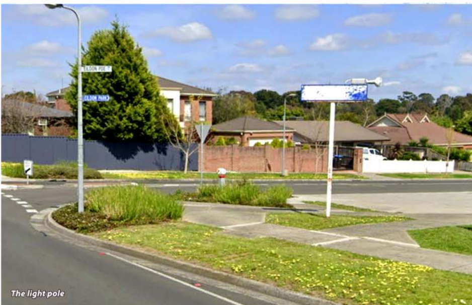
The light pole